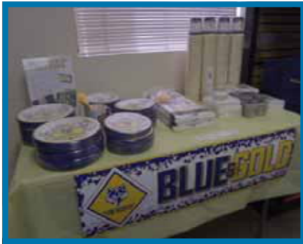
Blue & Gold plates, napkins, cups and more!!